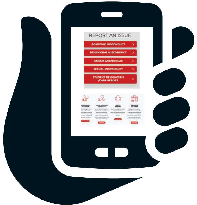
Top image is a screenshot of University Safety website on how to report. Lower image is a screenshot of Center for Student Wellness website.

Despite recent efforts at the University of Utah to increase awareness around campus safety, IPV/DSV is rarely mentioned in messaging aimed to protect and educate students. Digital control/stalking, financial abuse, verbal abuse, emotional manipulation, and sexual coercion—all behaviors exhibited in relationship abuse—are often elided for a focus on “stranger danger” or self-defense tactics. An example of this is the SafeRide signs around campus or the focus on increased lighting at night. As described above, those efforts on physical safety seem to be top of mind for students thinking about campus safety yet not at all connected to behaviors associated with dating violence.